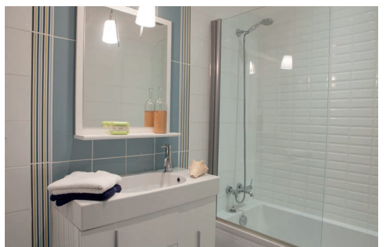
Accommodation for up to 52 people